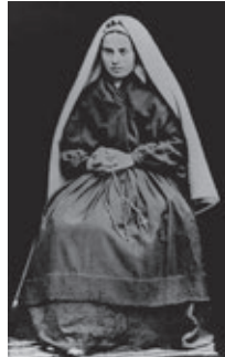
Bernadette Soubirous (1844-1879) in 1866

Fourteen-year-old Bernadette was gathering firewood by a river when she spotted a golden light coming from a nearby cave. When Bernadette came closer, she saw a beautiful lady holding a rosary. The lady spoke lovingly to Bernadette and asked her to pray the rosary with her.