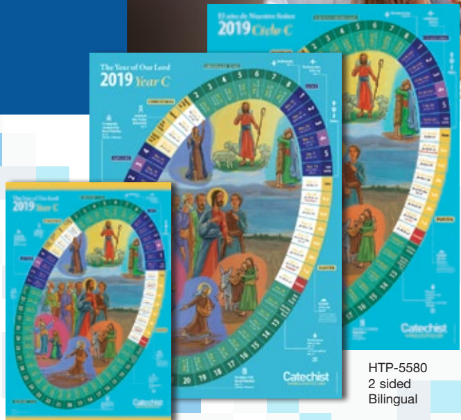
HTP-5580 2 sided Bilingual